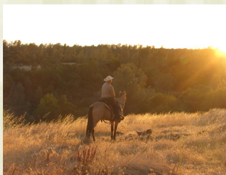
Russ Riding Bleu

Lastly , I want to mention is to plan your shoeing needs with your farrier.